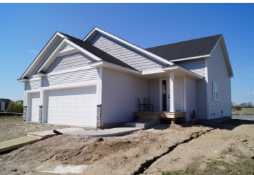
20910 Hardwood Road N, Forest Lake, MN The Pueblo | NOW $359,900! 1,392 FSF | 3 Bed | 2 Bath | 3 Car