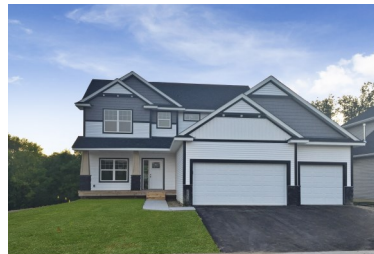
20630 Hamlet Avenue N, Forest Lake, MN The San Fran Loft | NOW $474,900! 2,407 FSF | 3 Bed | 3 Bath | 3 Car