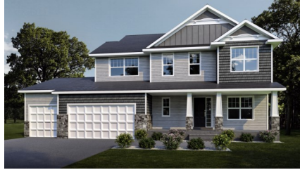
4508 121st Ct NE, Blaine, MN The Jamestown Sport Court | NOW $549,900! 2,907 FSF | 4 Bed | 2.5 Bath | 3 Car