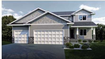
3248 Griggs SW, Prior Lake, MN The Birmingham | NOW $419,900! 1,966 FSF | 3 Bed | 2 Bath | 3 Car