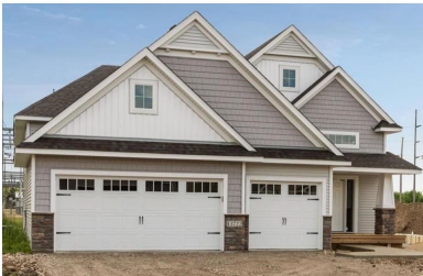
13722 Brunswick Ave S, Savage, MN The Denver WO | NOW $424,900! 2,721 FSF | 5 Bed | 3 Bath | 3 Car