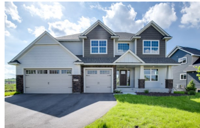
15750 Wyoming Ave, Savage, MN The Cape Cod | NOW $549,900! 3,858 FSF | 4 Bed | 4 Bath | 3 Car