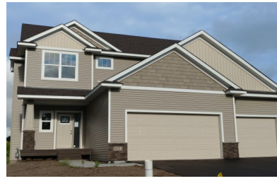
9113 Hamlet Ave, Cottage Grove, MN The Sonoma | NOW $429,900! 2,547 FSF | 4 Bed | 3 Bath | 3 Car