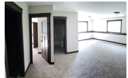
1346 Meadow Lane, Shakopee, MN The Pueblo | NOW $408,600! 1,392 FSF | 4 Bed | 3 Bath | 3 Car