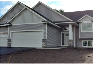
9000 Hamlet Ave, Cottage Grove, MN The Augusta II | NOW $405,900! 2,528 FSF | 5 Bed | 3 Bath | 3 Car